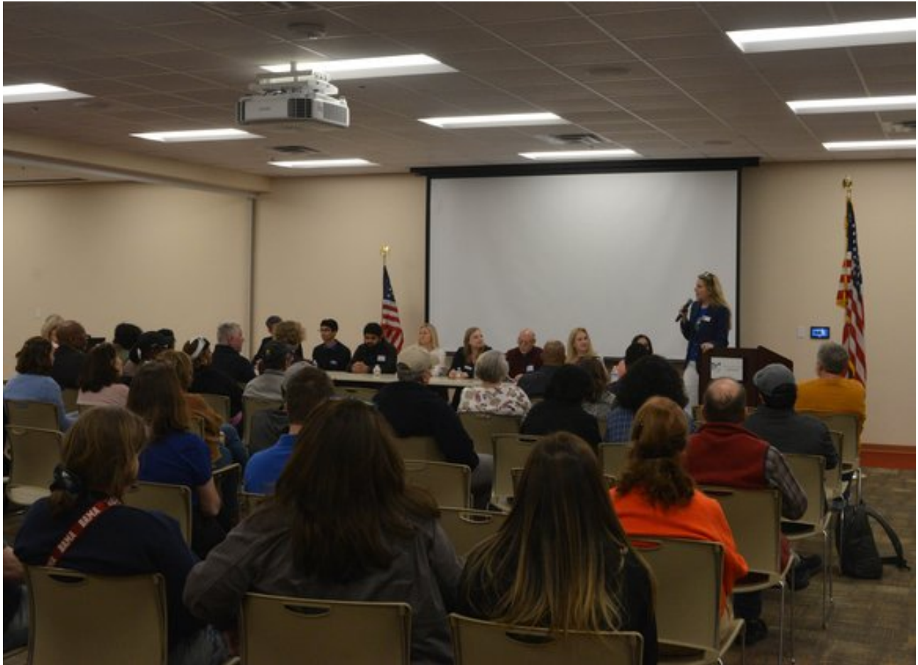
Forsyth County Democrats gathered at Sharon Forks Library for a town hall meeting on Sunday, March 24

'Local candidates are the ones that are going to get people out to vote.' Forsyth County Democrats host town hall.